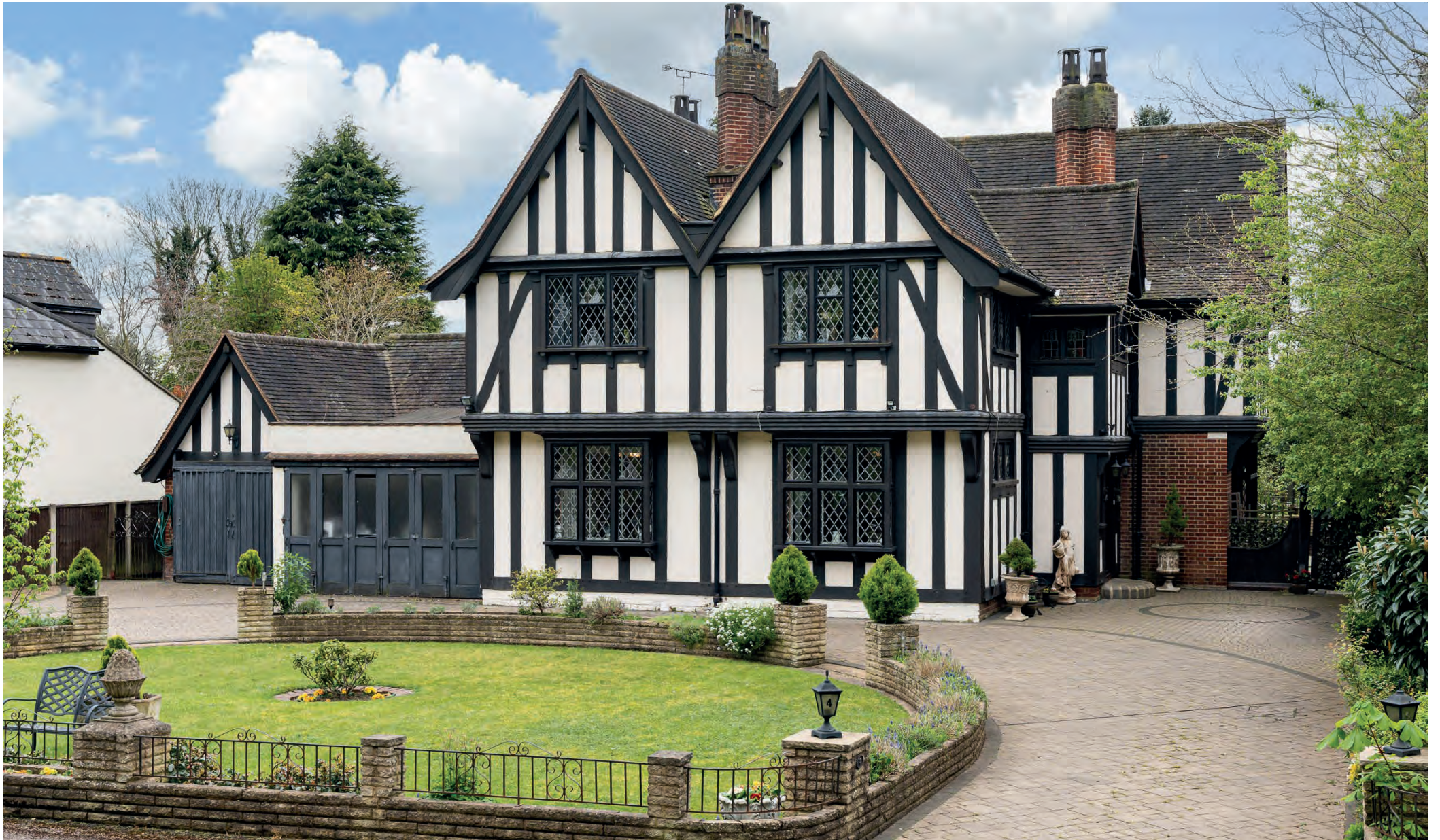
Nelmes Way House 4 Nelmes Way | Emerson Park | Essex | RM11 2QZ